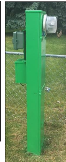
Skeeter S. installed & painted the new sprinkler controller. Karen F. purchased some of the materials.